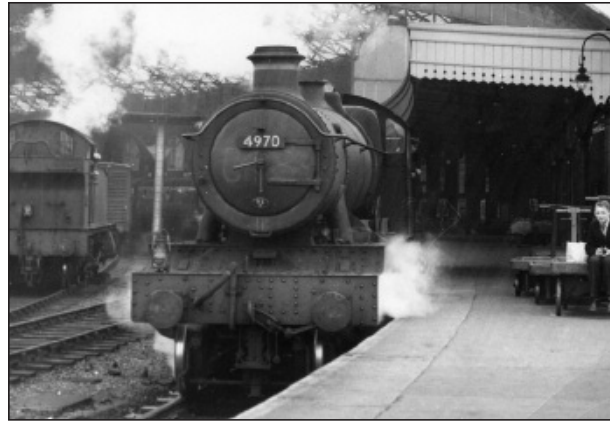
4970 'SKETTY HALL' from Taunton shed detaching from an Up passenger working as a 4575 class 2-6-2T brings a train of vans through the station.