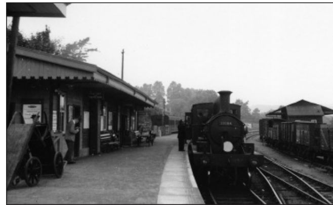
One of the three locos 30584, ex SR 3520, from Exmouth Junction shed has arrived at Lyme Regis in the early 1950s.