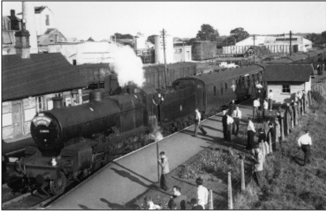
A railtour organised by the The Locomotive Club of Great Britain is hauled by 53804.