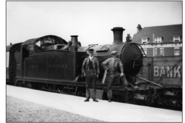
The crew of what appears to be 4577 by their engine as they wait at Minehead with a train to Taunton in the early 1930s