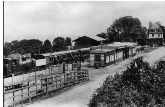
This vintage photo that was taken at Lyme Regis in 1907 shows Exmouth Junction shed's O2 class 227 waiting to depart on a train to Axminster.